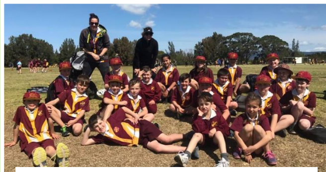
Stage 2 @ DRAGON TAG Gala Day

Students return to school on Monday 9th October