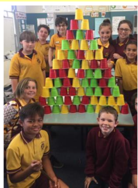
MATONG learning about triangular number patterns.