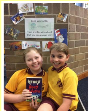
Students celebrating books leading up to Book Week.