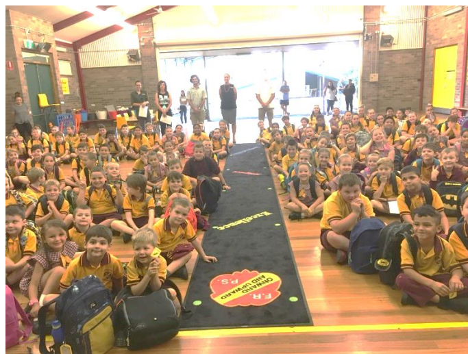
Our new floor runner mat in the hall!

Please come along this Thursday 23 rd March and be a part of a focus group talking about what it is like to bring up children in Unanderra. Tea/coffee and morning tea will be provided. If you can spare a couple of hours for this, that would be great. You will receive a $25 gift voucher for attending!