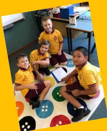
Yulara – Working on Place Values