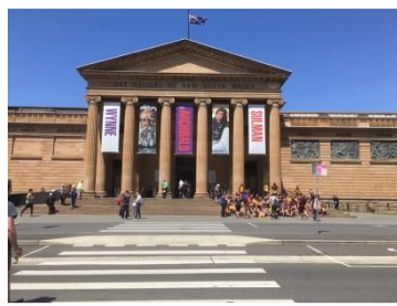
Archibald Exhibition at the Art Gallery of New South Wales