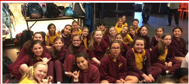
Our Choir ready for some practice