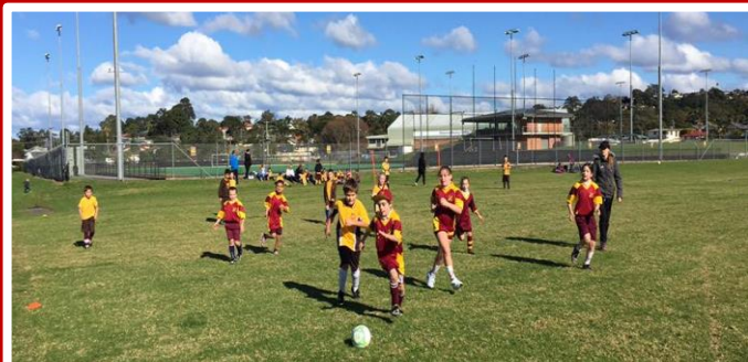
Students participating in the Soccer Gala Day