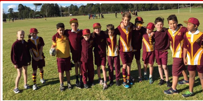
Students enjoying Touch Football Gala Day