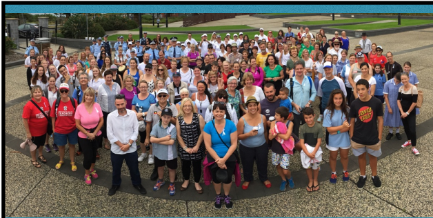
2014 White Ribbon Day walk